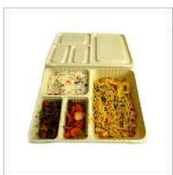
4 Section Tray With Lid