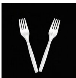
7 Inch Fork Cornstarch