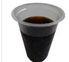
300 MI Wave Cup