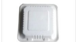
8 Inches SQUARE BAGASSE CLAMSHELL