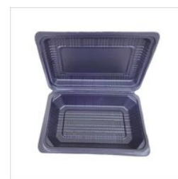
BLACK DISPOSABLE CLAMSHELL