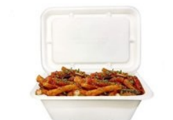
650ml Bagasse Food Box