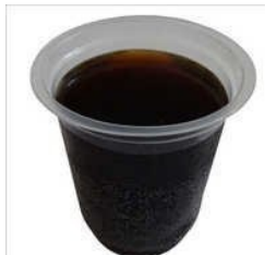
200 MI Wave Cup