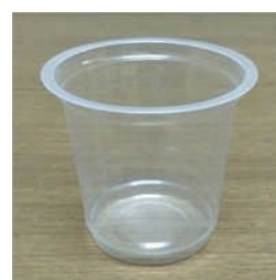
200 MI Plain Cup