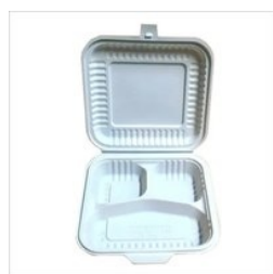
3 CP CLAMSHELL CORNSTARCH

10" PLAIN PLATE, 1000ml Container with Lid, 1000ml Milky Container, 100ml Paper Container With Pet Lid, 11" 4 CP Plate Bagasse, 110ml Cornstarch Cup, 12" 4 Section Biodegradable Plate, 12" Biodegradable Plain Plate, 120ml Flower Wati, 130ml Biodegradable Cup, 130ml Paper Cup, 14 CM WOODEN FORK, 14 CM Wooden Spoon, 150 ml Oval Bowl, 150 ml Paper Cup, etc.