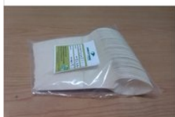
Biodegradable Party Packs – Spoons