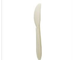
Biodegradable Party Packs– Knives