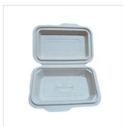
750ML BIODEGRADABLE CLAMSHELL