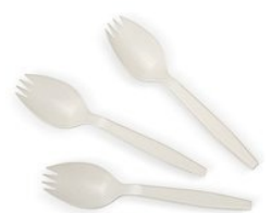
5.5" Biodegradable Spork