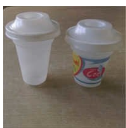
Ice Cream Kulfi Cups